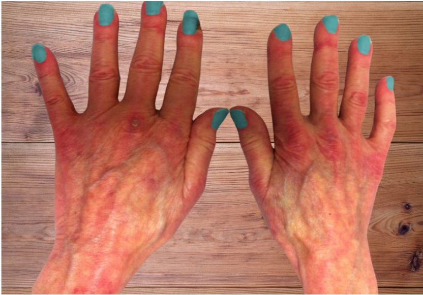
Dorsum of hand