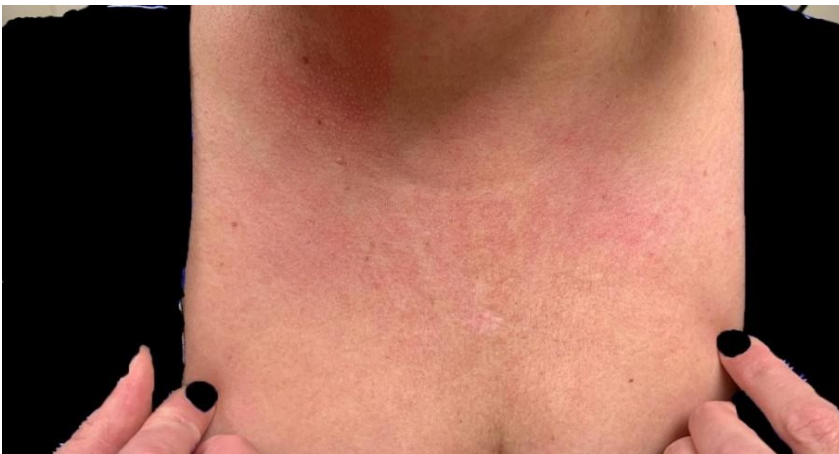
Upper chest (V area of neck)