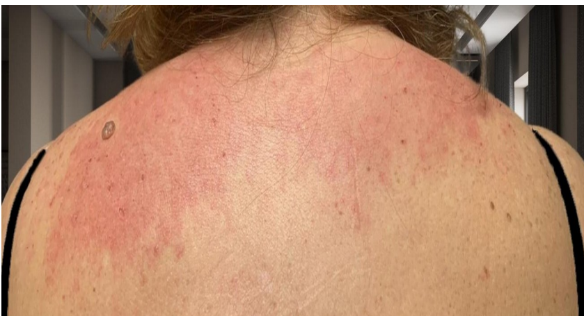
Upper back and Shoulder