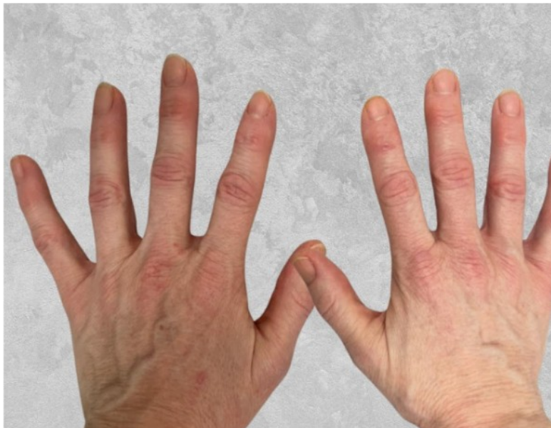
Dorsum of hand